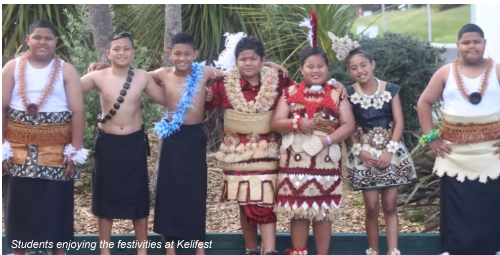
Students enjoying the festivities at Kelifest

Hei whakatipu rangatira mō apōpō - Growing great leaders for a great future